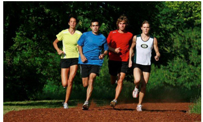
A disc golf course is proposed to overlap part of Pre's Trail.

As stewards of Pre's Trail, the Oregon Track Club feels strongly that both safety and quality of experience need to be factors in evaluating whether these activities are compatible. While we support the efforts of area disc golfers to establish a second course in addition to Westmoreland, our stewardship of Pre's Trail is our first responsibility.